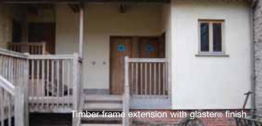
Timber frame extension with glaster® finish