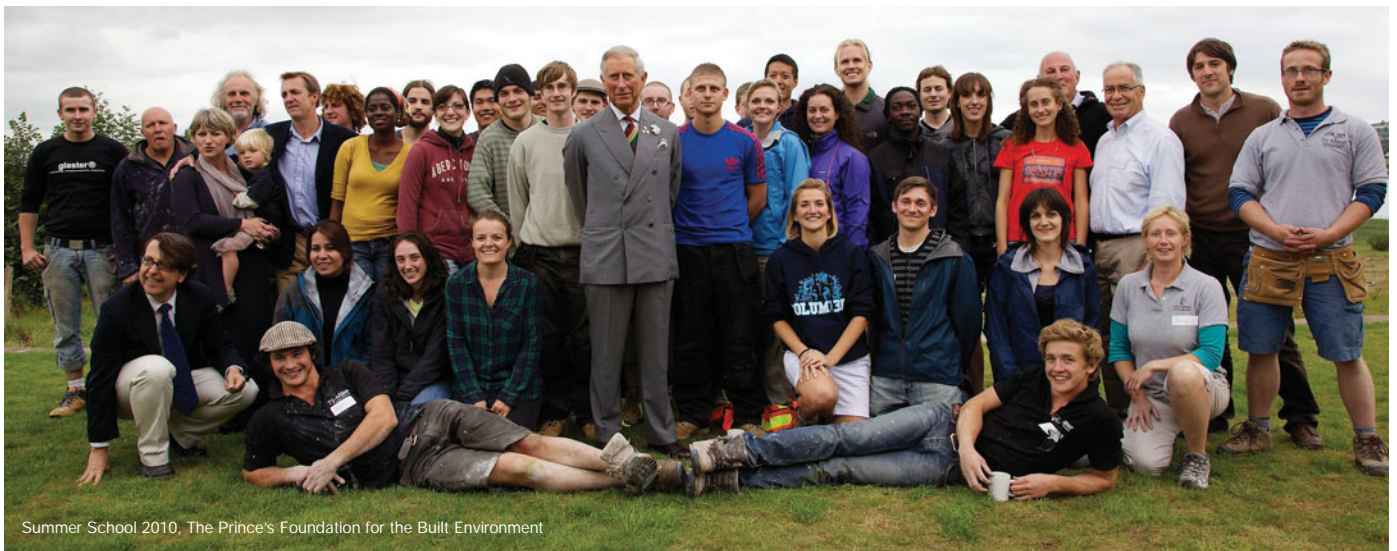
Summer School 2010, The Prince's Foundation for the Built Environment

Tŷ-Mawr itself has become an exemplar - as well as demonstrating an approach to repair using Tŷ-Mawr products and systems, various technologies have been incorporated such as solar thermal, rain-water harvesting, Pilkington-K glass, heat recovery from the manufacturing yard and biomass heating. This has helped reduce Tŷ-Mawr's own carbon dioxide emissions by up to 40 tonnes per annum.